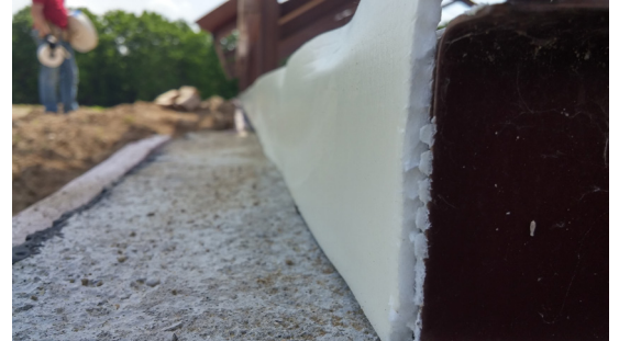
Quik-Stop Trash Free on the exterior flange (above).